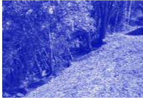
Demonstration site on the Orianna Creek

Two years ago the CLSLC received funding from the Great Lakes National Program Office (GLNPO) of the Environmental Protection Agency (EPA) to restore riparian buffer areas throughout the Lake Superior Basin. Five restoration sites have been chosen, the installation of a native plant buffer will be installed in the spring and summer of 2005, and a conservation easement will be placed on each site. These sites will serve as demonstration and educational sites for the